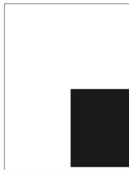
Quarter Page Ad Size: 3.875" x 5.125"