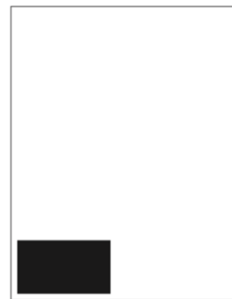
Business Card Ad Size: 3.5" x 2"

All submitted files must meet the size requirements listed above, be 300 dpi and be in CMYK colour mode